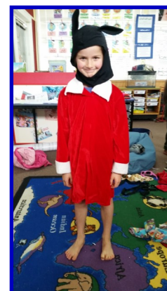
Room 3 in dress-up mode!